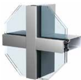
FOUR-WAY STRUCTURAL SYSTEM

As per requested aesthetic appearance, curtain walls can be: